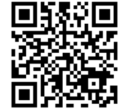
Location Hours and Contact